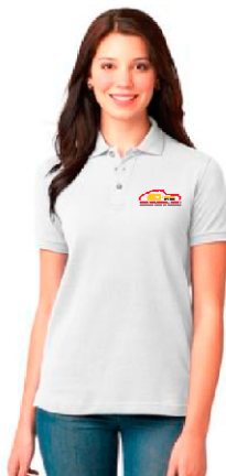
Port Authority® Ladies Heavyweight Cotton Pique Polo 7-ounce 100% cotton