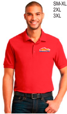
Gildan® Double Pique Cotton Sport Shirt 6.5-Ounce 100% Cotton