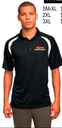
Sport-Tek® Dry Zone® Colorblock Raglan Polo 4-ounce, 100% polyester