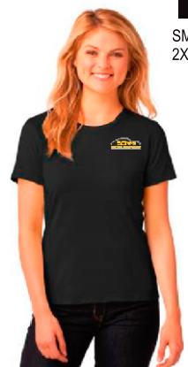
Anvil® Ladies Ring Spun T-Shirt 4.5 ounce, 100% cotton