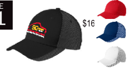
Port Authority® Two-Color Mesh Back Cap $16