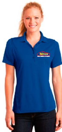
Sport-Tek® Ladies Dry Zone® Raglan Accent Polo 4-ounce, 100% polyester