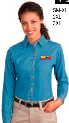
Port & Co Long Sleeve Faded Denim Shirt 6.5 ounce/100% cotton