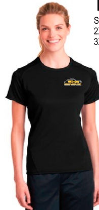
Sport-Tek® Ladies Dry Zone® Raglan Accent T-Shirt 4-ounce, 100% polyester