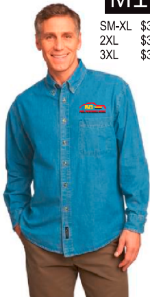
Port & Co Long Sleeve Faded Denim Shirt 6.5 ounce/100% cotton